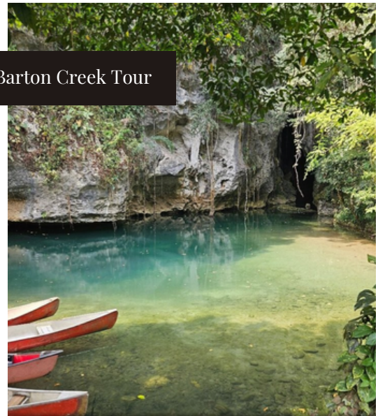
Barton Creek Tour

I would love to visit the ruins around San Ignacio and throughout Belize