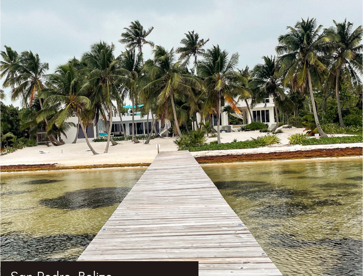
San Pedro, Belize