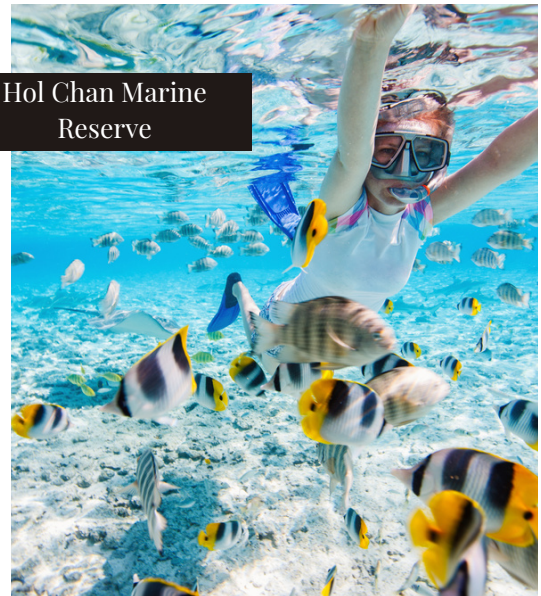
Hol Chan Marine Reserve

I'd love to go snorkeling at the Hol Chan Marine Reserve.