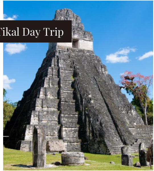
Tikal Day Trip

Hopefully our guy will be big enough next time to do a cave tour together. The boys loved their excursion.